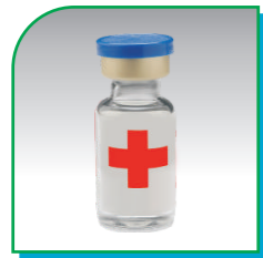
Generation Storage, Monitoring and Distribution system for purified water