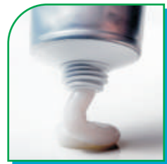
Cream, Ointment, Lotion, Gel and Suppository