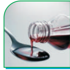
Syrup and Suspension