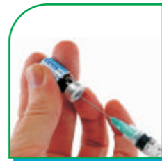
Hi Potent drugs, Cytotoxic, Anticancer, Hormones and Steroids