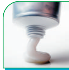
Cream, Ointment, Lotion, Gel and Suppository