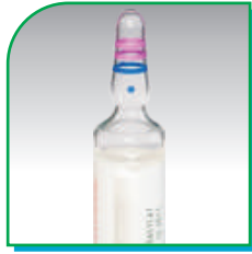
Parenteral Formulation Compounding