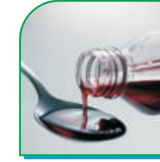
Syrup and Suspension